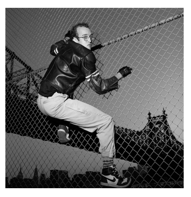
Awet Hosts Solo Gianfranco Gorgoni Photo Show