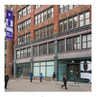
The Grey Art Museum Relocates to NoHo