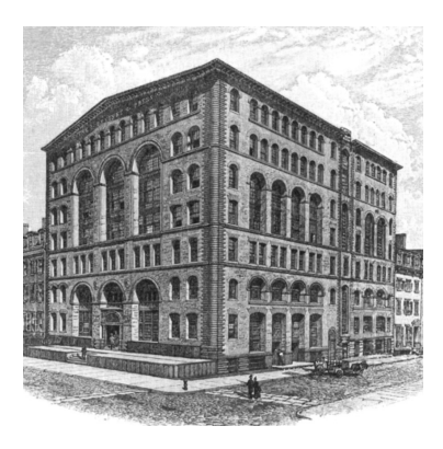
Take the Reinventing Bond Street Walking Tour